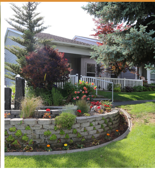
Large back patio space with storage and fence.

ACCOMMODATION FEE $395,000 MONTHLY SERVICE FEE INCLUDES MAINTENANCE AND GROUNDS KEEPING