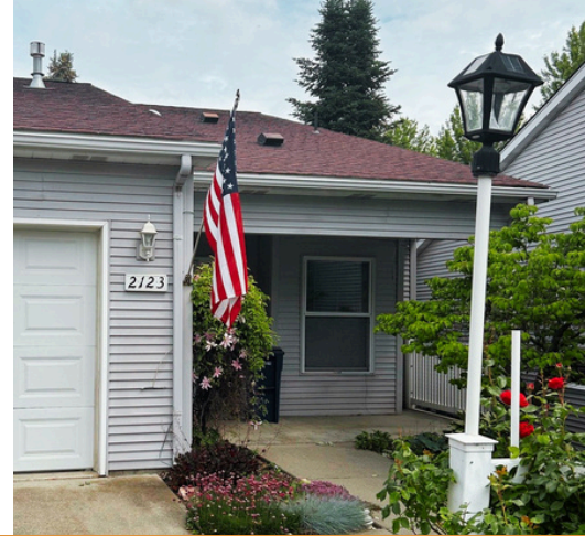
2123 East North Crescent