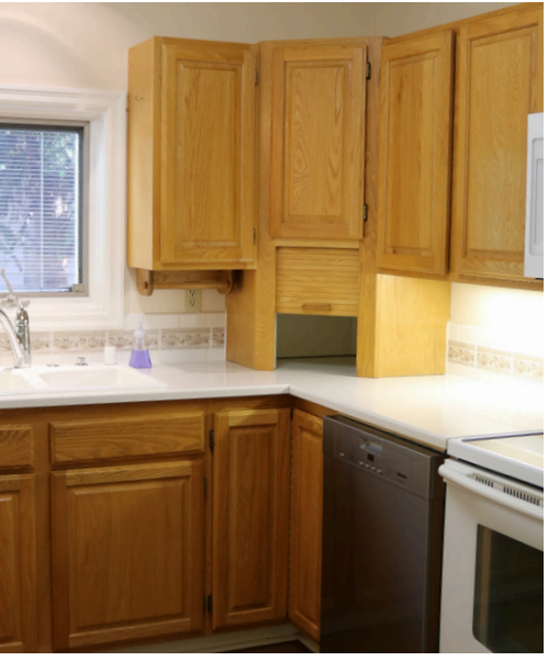
Window over kitchen sink, choose new backsplash