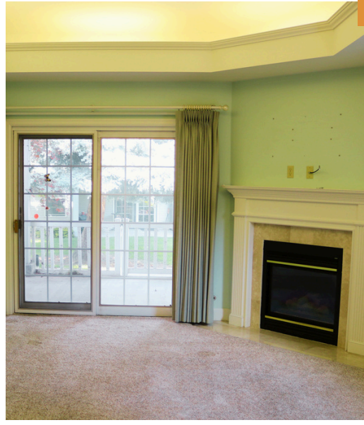
Slider to outside and gas fireplace. Extra windows