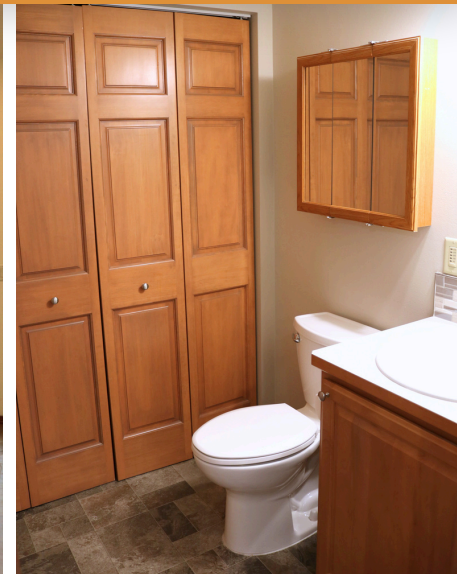
Updated Tile, Counters and Showers - Ready for Move-in!

ACCOMMODATION FEE $379,900 MONTHLY SERVICE FEE INCLUDES MAINTENANCE AND GROUNDS KEEPING