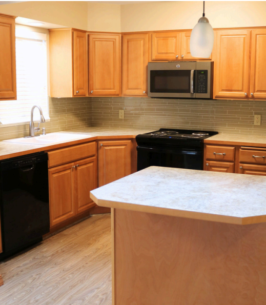
Updated Appliances, Tile Back Splash, and Counter Tops!