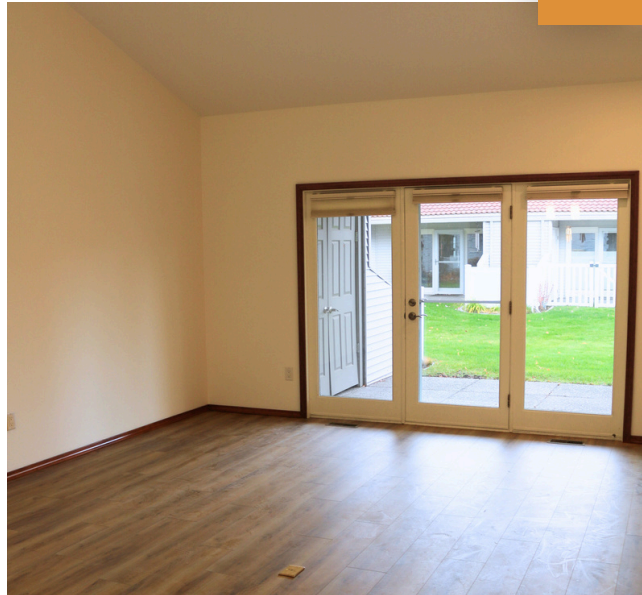
Large Living Area with Vaulted Ceiling, Skylights, and Back Patio