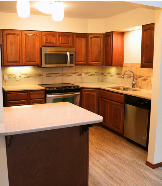
Updated Appliances, Tile Back Splash, and Counter Tops!