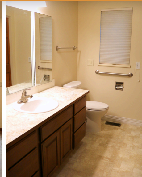
Updated Tile, Counters and Showers - Ready for Move-in!

ACCOMMODATION FEE $379,900 MONTHLY SERVICE FEE INCLUDES MAINTENANCE AND GROUNDS KEEPING