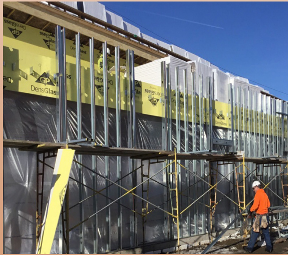
LAC Drywall framing exterior walls on the south side

NAC Architecture 1203 West Riverside Avenue Spokane, WA 99201 509.838.8240 www.nacarchitecture.com