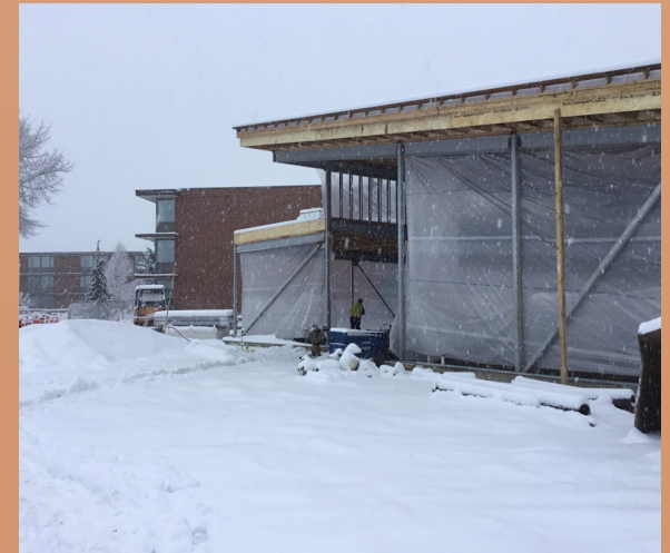
Bouten hanging plastic for weather protection due to cold temperatures