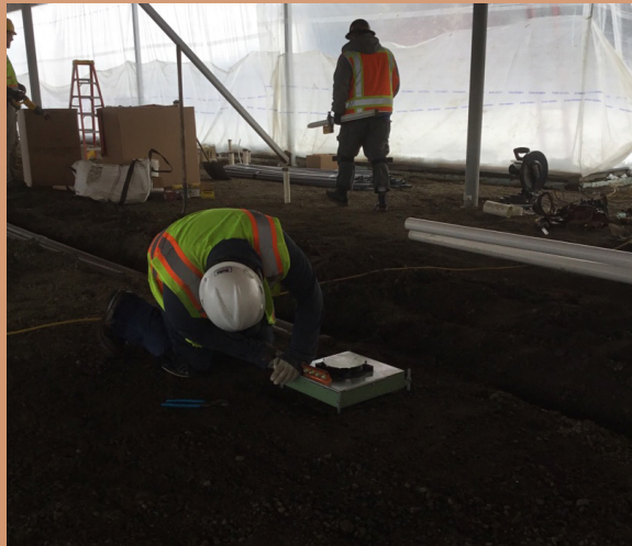
Summit Electric setting floor boxes in the dining area